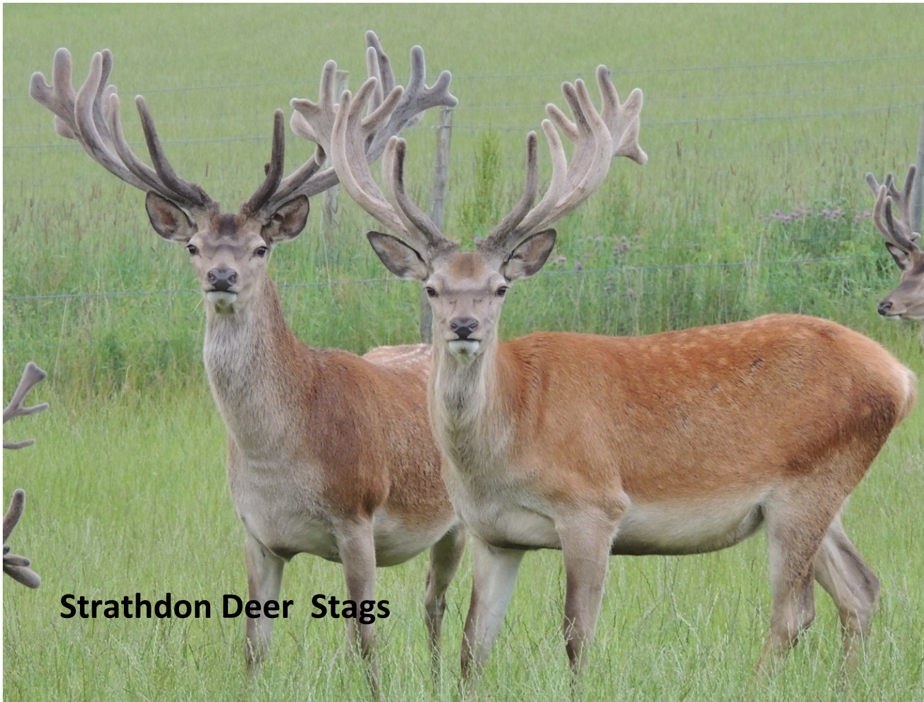
Strathdon Deer Stags